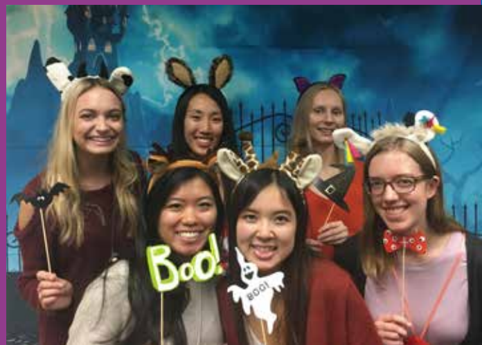
Several of our research coordinators held a Halloween party in their workspace for students and staff on October 31.