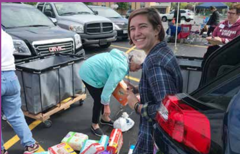
This fall, the Washington University Student Occupational Therapy Association (WUSOTA) Community Service Committee collected and donated 3,059 diapers to babies and toddlers in need at the St. Louis Diaper Bank.