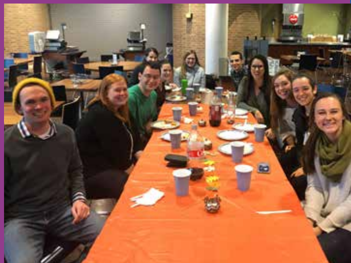
WUSOTA's Social Committee organized a Friendsgiving Potluck in November.